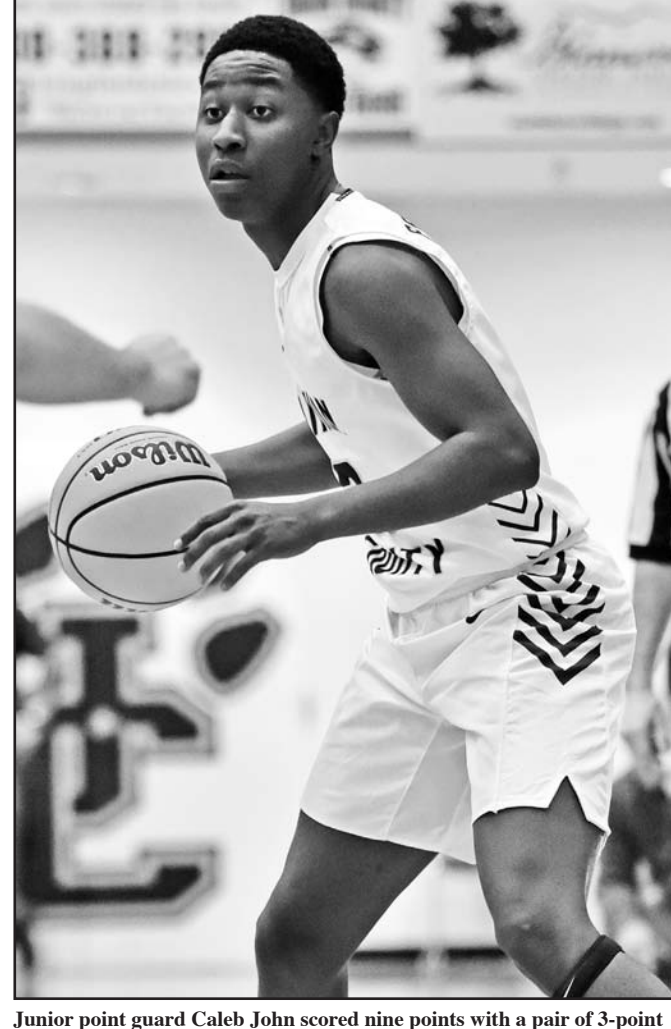
baskets in his Union County debut.